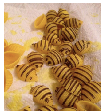
Bee pasta shells, useful for counting activities.