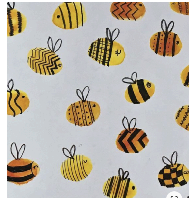
Finger print yellow bees with different black pen patterns. Great for making wrapping paper or a display.