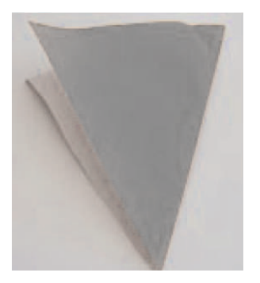
1. Start by folding your square in half diagonally, and creasing carefully.