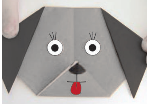
6. Add your dog's features by adding 'sticky eyes' and drawing in the nose...woof!

5. Now fold the bottom point up to form the dog's nose.