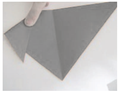
3. Turn the triangle so that the long side is at the top. Fold one of the corners down, as shown in the photo, to form an ear.

2. Fold your triangle in half again to form a crease. Open it back out again.